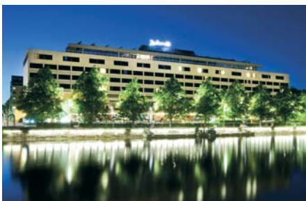
Radisson Blu Marina Palace Hotel