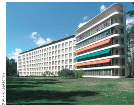
The Paimio Sanatorium

This tour will present the most important and world-famous works of three masters of Finnish Modernism: Alvar Aalto (1898-1976), Erik Bryggman (1891-1955) and Pekka Pitkänen (b. 1927). Aalto and Bryggman brought Functionalism to Finland and Pitkänen was Bryggman's apprentice in the 1950s. The Paimio Sanatorium (1929-1933) was Alvar Aalto's international breakthrough and the start of his organic approach to Functionalism. Bright colours and views of the outside world are used to cheer up the patients. Structural solutions were very ambitious. In Bryggman's Resurrection Chapel (1938-1941) and Pitkänen's experimental concrete architecture in the Chapel of the Holy Cross (1963-1967), nature and natural light play a crucial role. Lunch will be served at the Tuorla Manor - a 19 th century neoclassical manor complex, the extension and renovation of which was designed by Erik Bryggman.