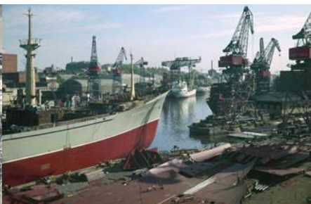
Turku shipyard in 1951