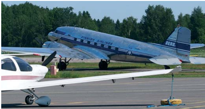
DC 3 aircraft

N.B.: Helsinki-Malmi Airport was listed among Europa Nostra's 7 Most Endangered sites in Europe in 2016